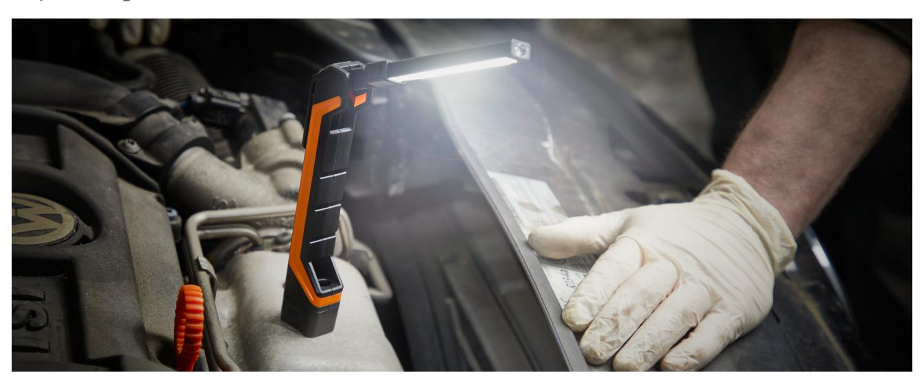
3xAAA Batteries included Ready to use directly after purchase